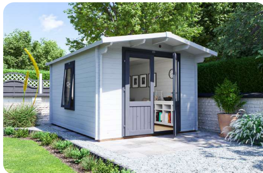
Model shown 3.0m x 4.0m

34mm Walls 45mm Walls 45mm Walls with SideStore 45mm with uPVC Insulated