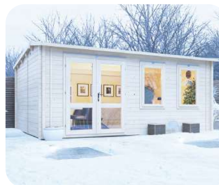
5.5m x 4.5m