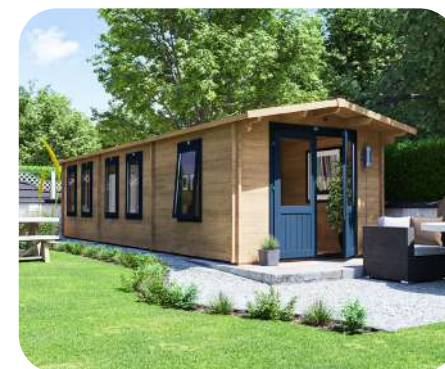
3.0m x 9.0m