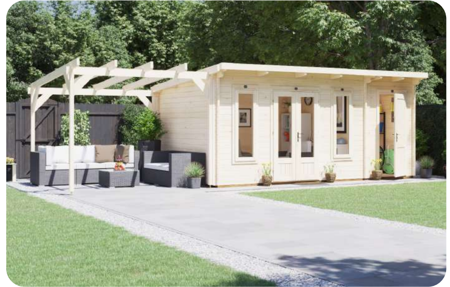
Model shown 7.5m x 3.0m

7.5m x 3.0m 12.5m x 3.0m 8.5m x 3.0m 13.5m x 3.0m 9.5m x 3.0m 11.5m x 3.0m