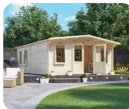
5.0m x 6.0m