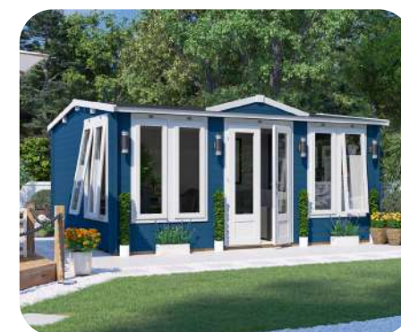
5.0m x 4.0m