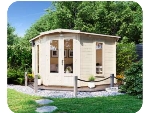
3.0m x 3.0m