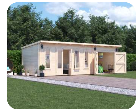
8.0m x 3.0m