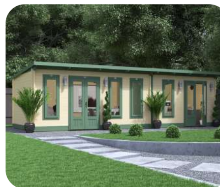
8.5m x 3.0m