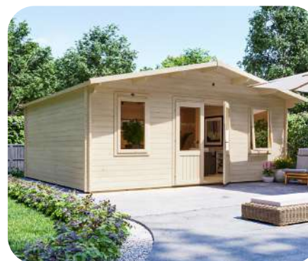
6.0m x 5.0m