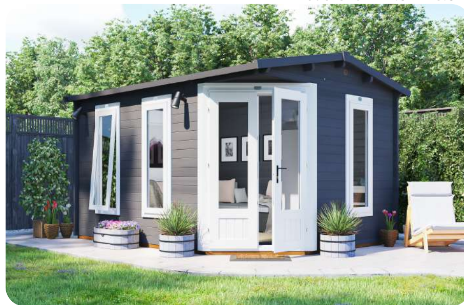
Model shown 4.0m x 3.0m