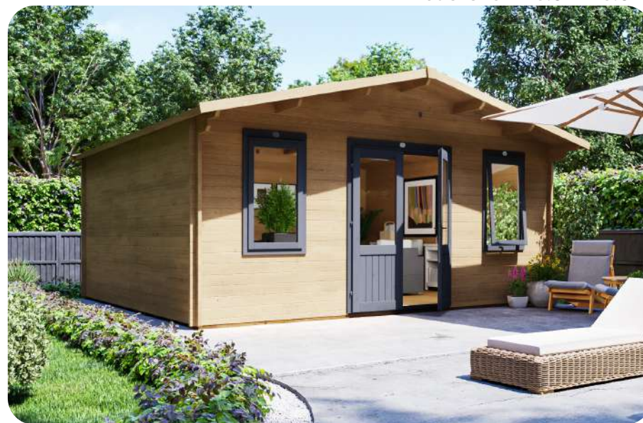
Model shown 6.0m x 5.0m