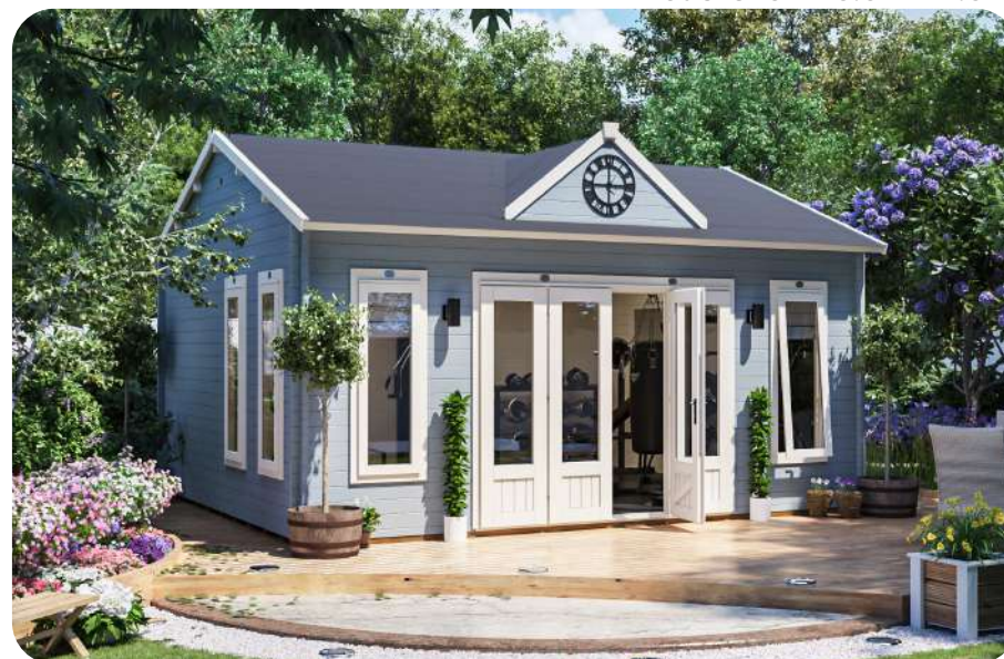
Model shown 5.5m x 4.5m

45mm Walls Choose to install your cabin with or without the roof dormer for either a classical or modern style. You choose!