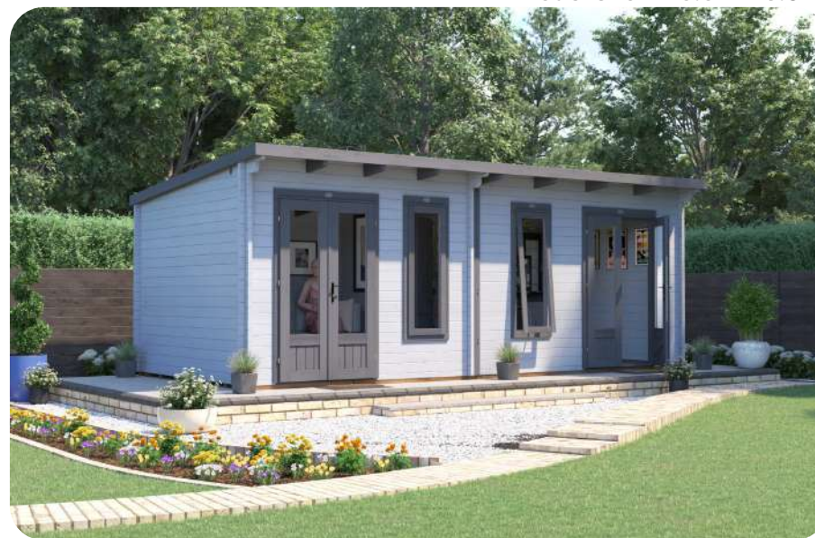
Model shown 6.5m x 3.0m