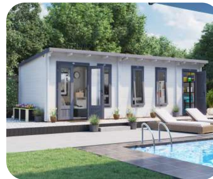
7.5m x 3.0m