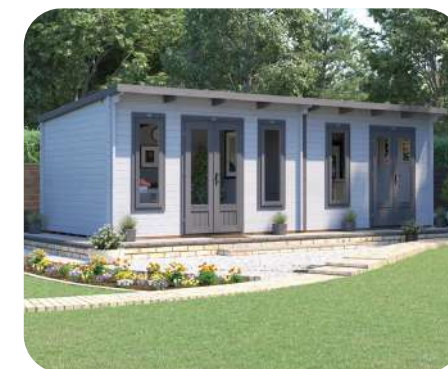
7.5m x 3.0m