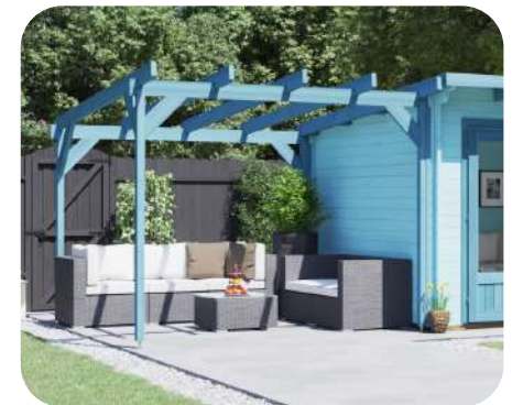
This model includes a SideStore