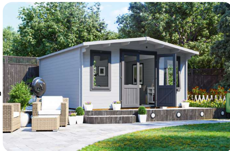
Model shown 5.0m x 5.0m