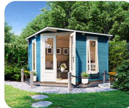
3.0m x 3.0m