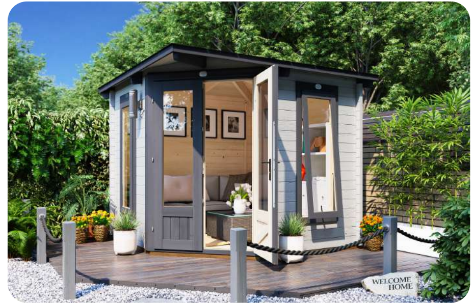
Model shown 2.5m x 2.5m