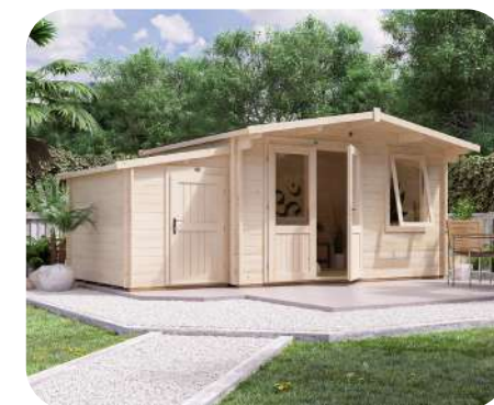
SideStore 5.5m x 3.0m