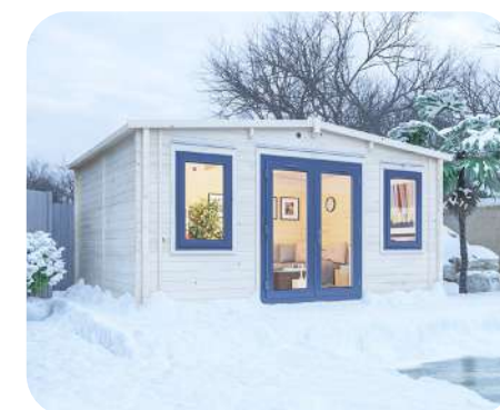
Insulated Upvc 5.0m x 4.0m