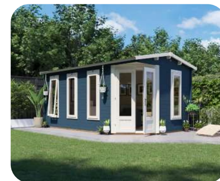
5.0m x 3.0m