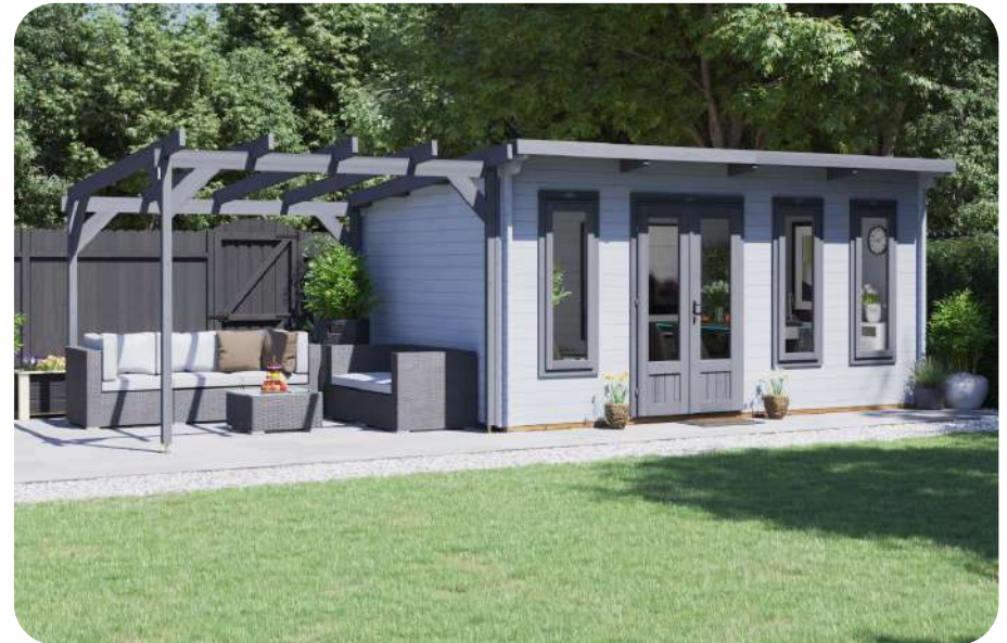
Model shown 8.0m x 3.0m

6.0m x 3.0m 10m x 3.0m 7.0m x 3.0m 11m x 3.0m 8.0m x 3.0m 9.3m x 3.0m