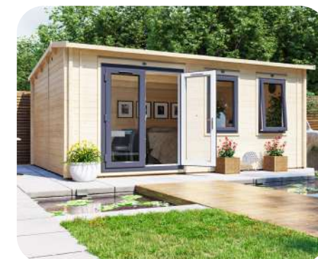
5.5m x 4.5m