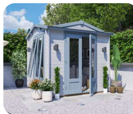
2.5m x 2.5m