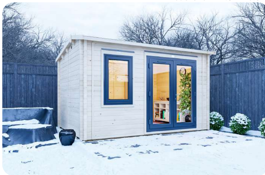
Model shown 4.0m x 3.0m