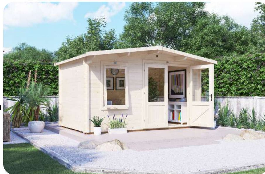
Model shown 4.0m x 2.5m

34mm Walls 45mm Walls 45mm Walls with SideStore 45mm with uPVC Insulated 62mm with uPVC Insulated