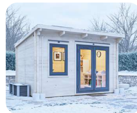
Insulated Upvc 4.0m x 3.0m