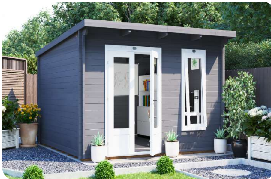
Model shown 3.5m x 3.5m

*This is an approximate time only, based on 2 people. Assembly time may vary depending on season/weather conditions, foundation type, ability of those constructing, etc