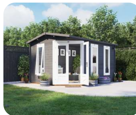
3.0m x 4.0m