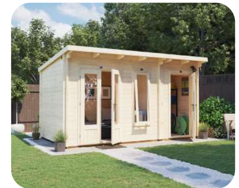
4.5m x 2.5m