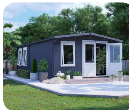
4.0m x 7.0m