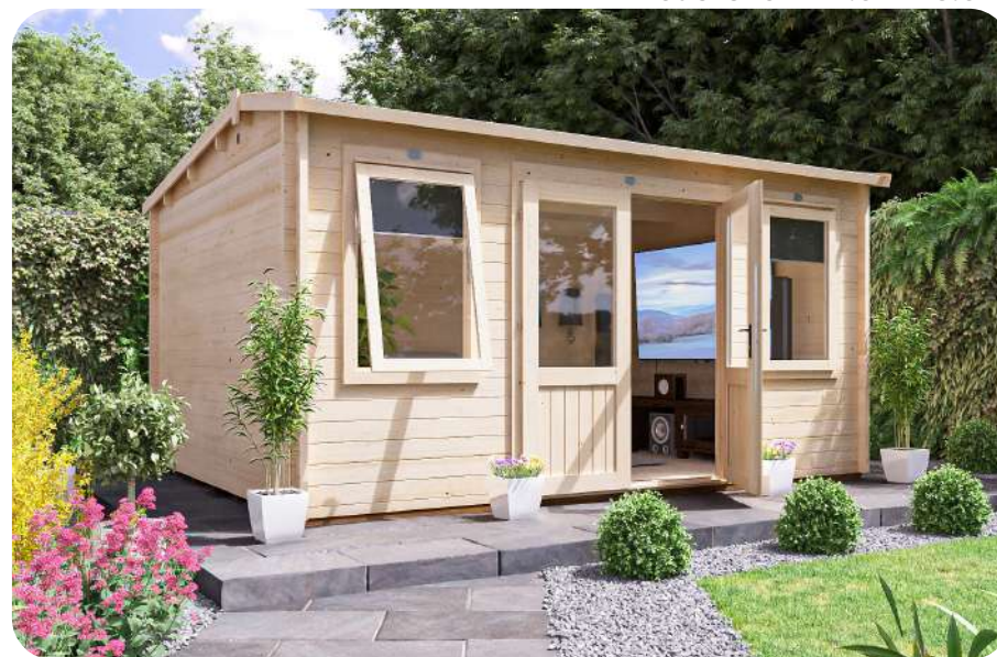
Model shown 4.5m x 3.5m