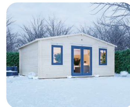
Insulated Upvc 6.0m x 5.0m