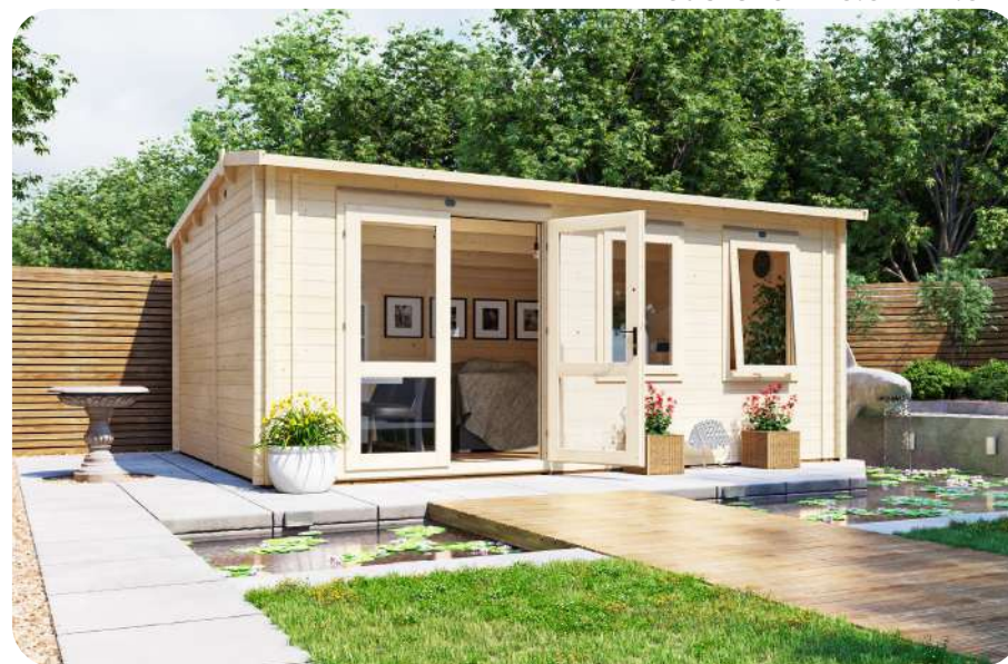
Model shown 5.5m x 4.5m