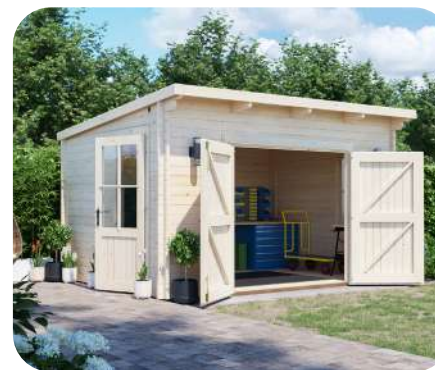
4.0m x 3.0m