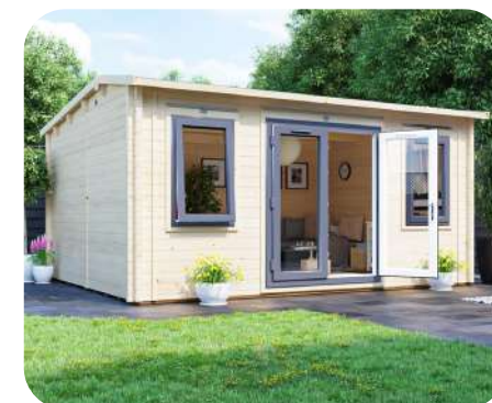
5.0m x 4.0m